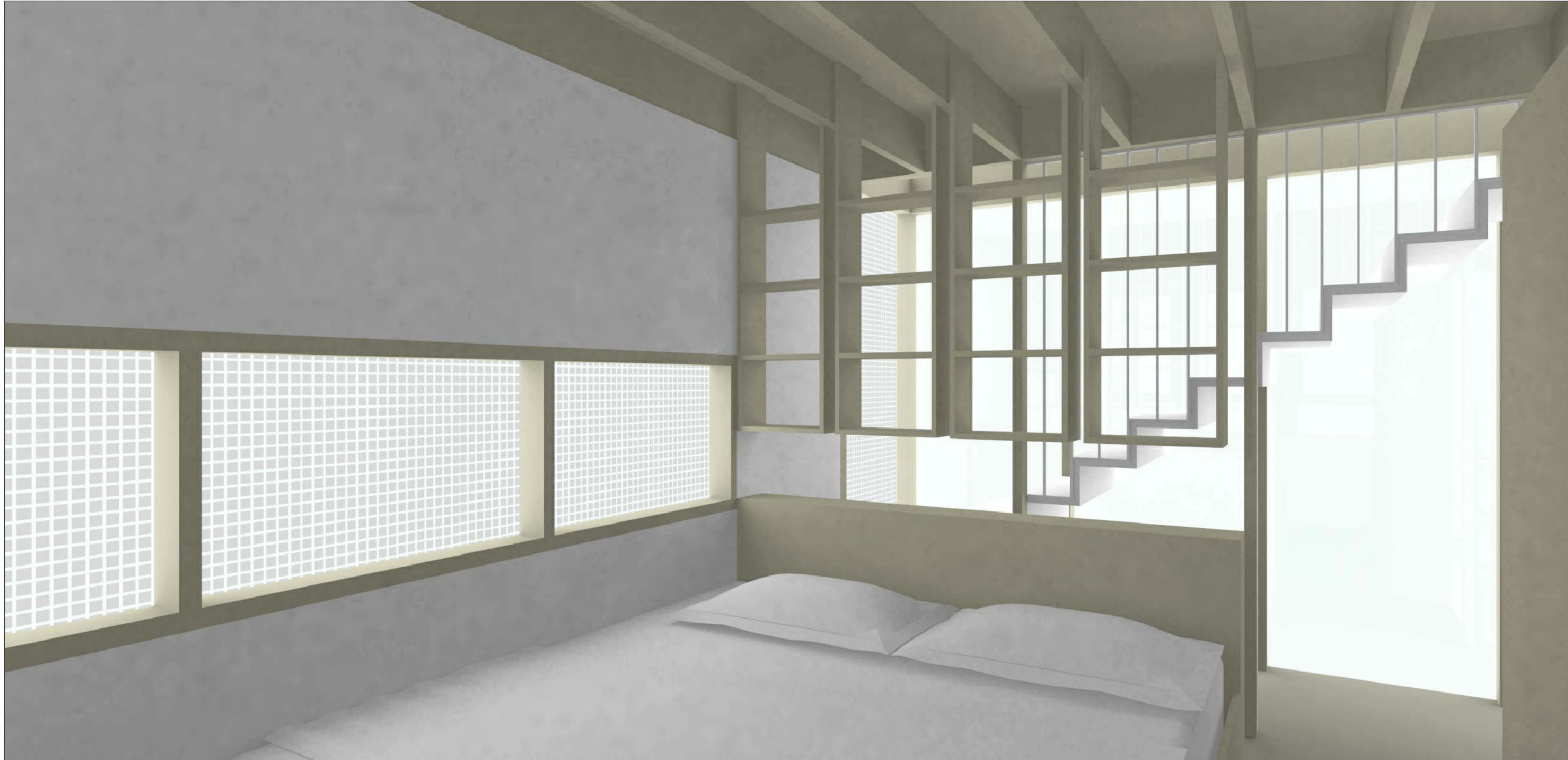
RENDER SECOND FLOOR - BED