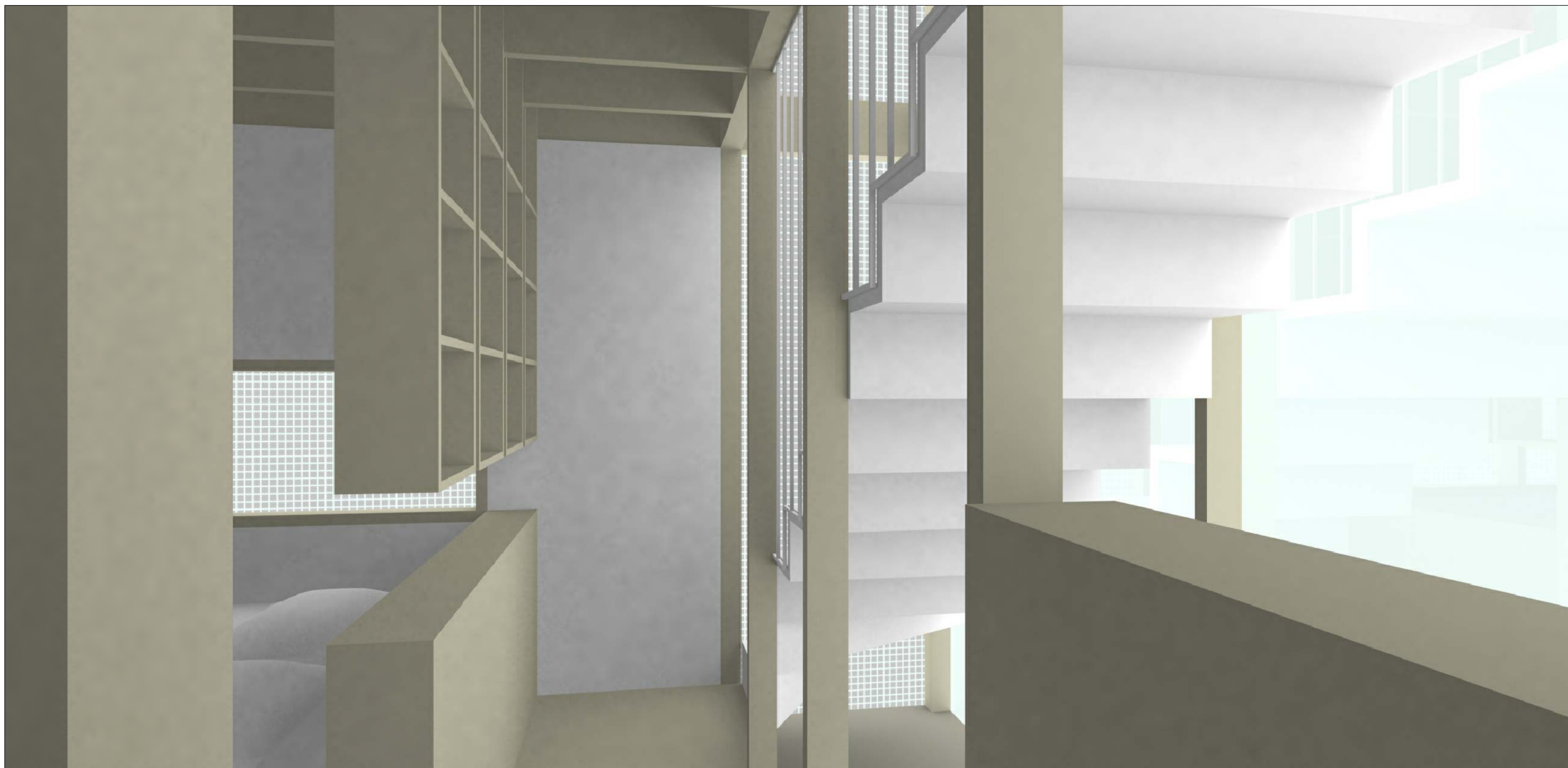
RENDER SECOND FLOOR - NORTHERN WALL