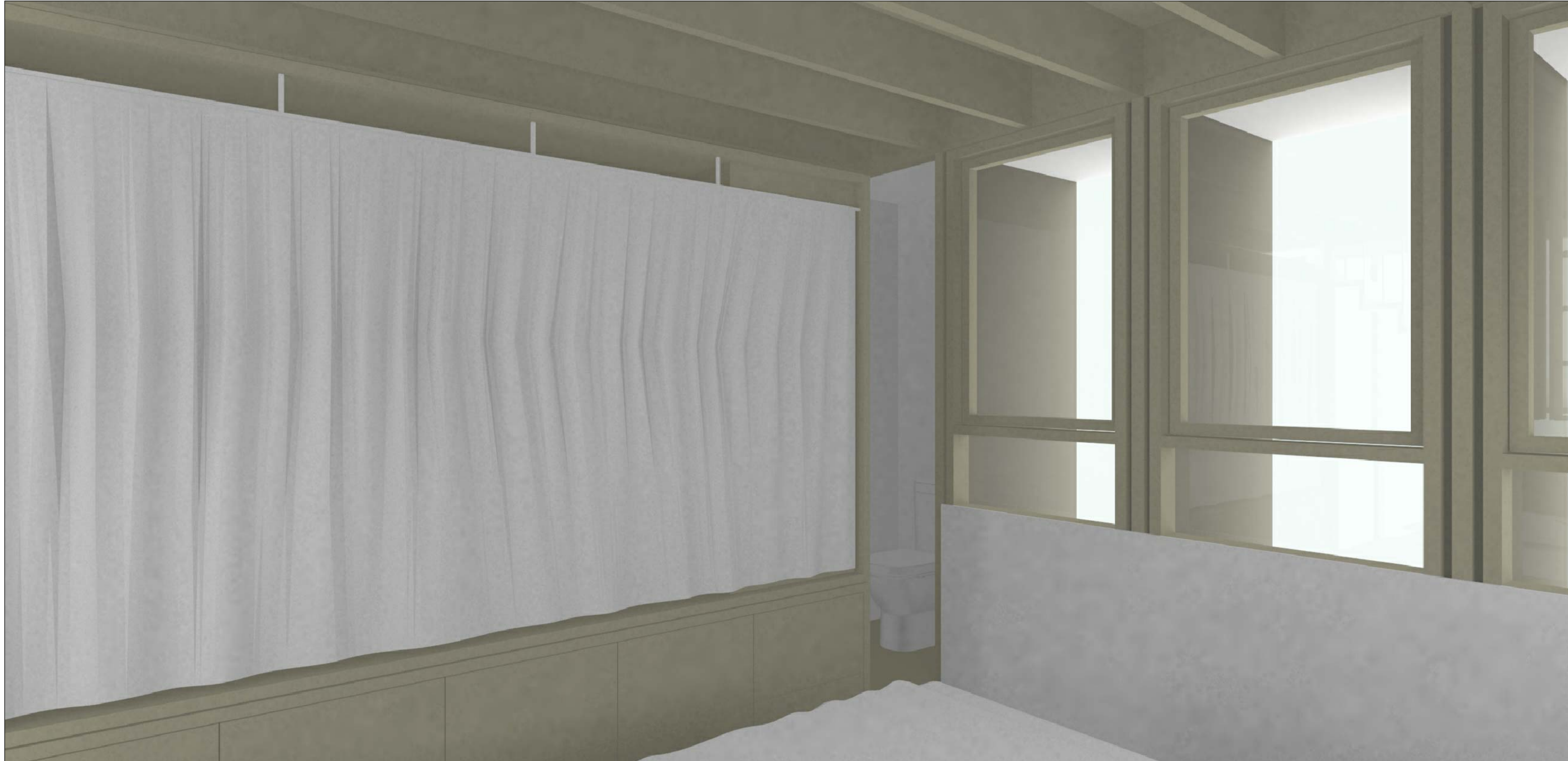
RENDER SECOND FLOOR - ROBE/BATHROOM